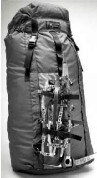
The Original Andinista